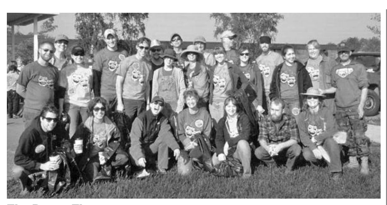
The Barter Theatre gang.