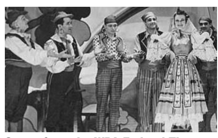
Scene from the WPA Federal Theatre Project production "Clown Prince" in Seattle, 1937.

• The government's WPA Federal Theatre Project is in full swing. Equity notes that "In all