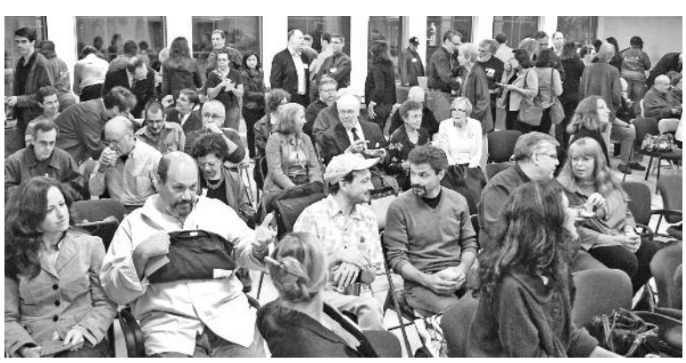
Chicago members discuss their "sneak preview" of the new Equity Building

ore than 50 Chicagoarea Equity Members got a "sneak preview" of the new Actors' Equity Building on October 11, 2010 (followed by the Regional Membership Meeting). Although there is nothing on the walls yet,