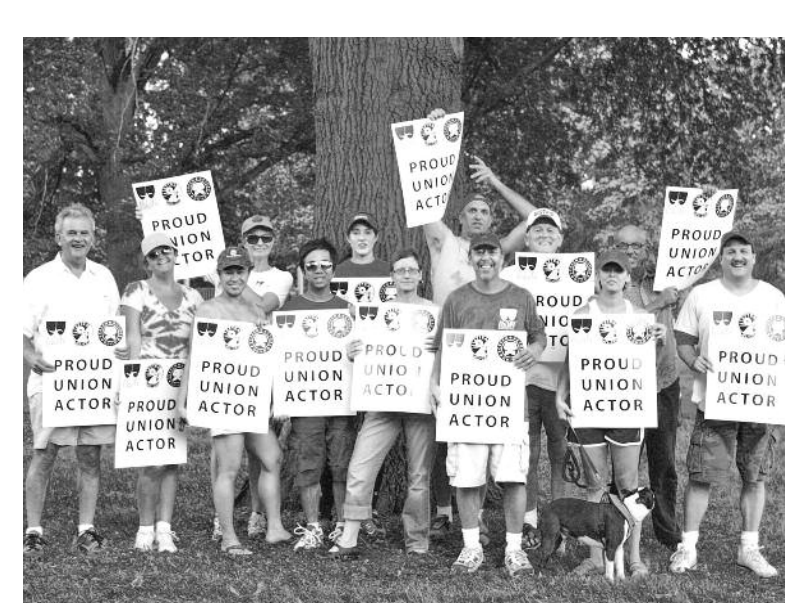
Equity members in Kansas City celebrated Labor Day by jointly hosting a performing arts union "Labor-Palooza" with AGMA, AGVA, AFTRA and SAG.