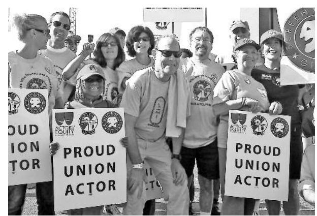
AEA, AFTRA and SAG members march in Philly's labor Day Parade.