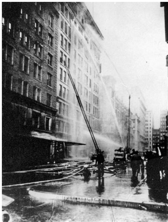
Firefighters try to contain the Triangle Shirtwaist Factory fire.

The Triangle Shirtwaist Factory fire in New York City on March 25, 1911 was one of the largest industrial disasters in the history of the city. The fire, which killed 146 garment workers, most of them young, immigrant women, led to legislation requiring improved safety standards and helped spur the growth of the International Ladies' Garment Workers' Union, which fought for better and safer working