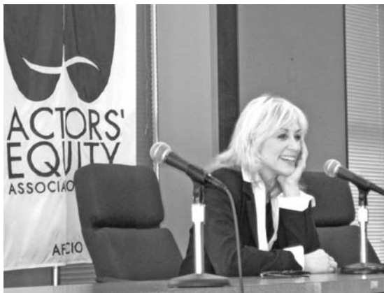
Judith Light at the Eastern Region new member reception.

down at her material.' As I said, I was a snob. I only wanted to do theatre and feature films. So when I did the soap and sitcom, I asked myself, 'How can I bring the training, and the personal dedication that I have in this business to this medium?' There is no medium in our business that you ever have to consider beneath you. When you bring your grace and your generosity and your intelligence to the role, you have no idea who you are going to elevate or uplift, including yourself. What matters is how you view it and what you bring to it."