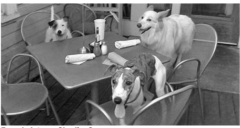
From I: Jetson, Charlie, Seamus.

As any pet guardian knows, the rewards of having an animal companion are astounding. Some of my best memories so far revolve around the adventures we've taken with our little "Wicked pack." Hiking in Utah, evening strolls along the river walk in San Antonio, sailing in Seattle, sunning on the dog beach in San Diego and romping in the snow in Denver. Something else