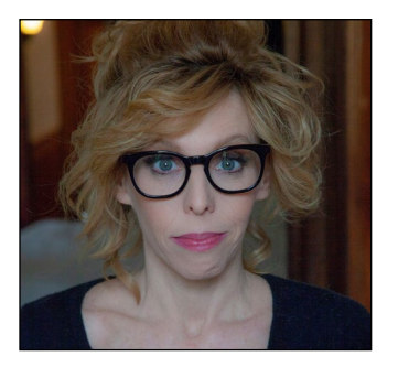
HIGMEC Read about how two members got their Equity cards.

Stage managers of color convene to discuss challenges and solidarity in the industry.