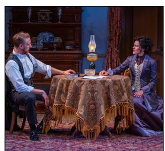
21 EQUITY ACROSS THE NATION There's nowhere quite like New Orleans.