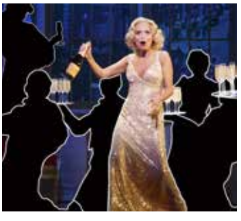
COVER STORY: EVERYONE ON STAGE Equity's new campaign aims to increase recognition at Tony Awards time.