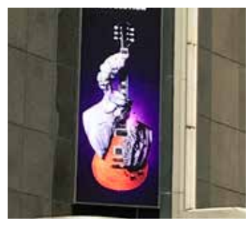
#EQUITYWORKS The Rocktopia campaign turned into a win for cast members and the union as a whole.