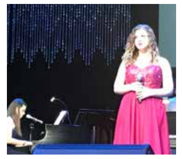
CARBONELL AWARDS Students from Marjory Stoneman Douglas High School find inspiration in tragedy.